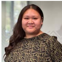
Lonafu Pusa Ngāti Rārua